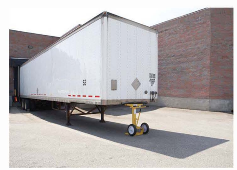
LDC's new EZ-Riser Trailer Stand The easiest, most convenient, and safest Trailer Stand on the market.

LDC has become a trusted name in managing dock and door safety, especially when it comes to preventing landing gear collapse, which has the potential to cause serious injury and damage to people and equipment. LDC's Trailer Stands are the best solution to increase work place safety.