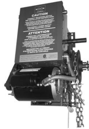
Commercial/Industrial continuous duty belt drive jackshaft operator with emergency chain hoist, load sensing device and emergency egress capability