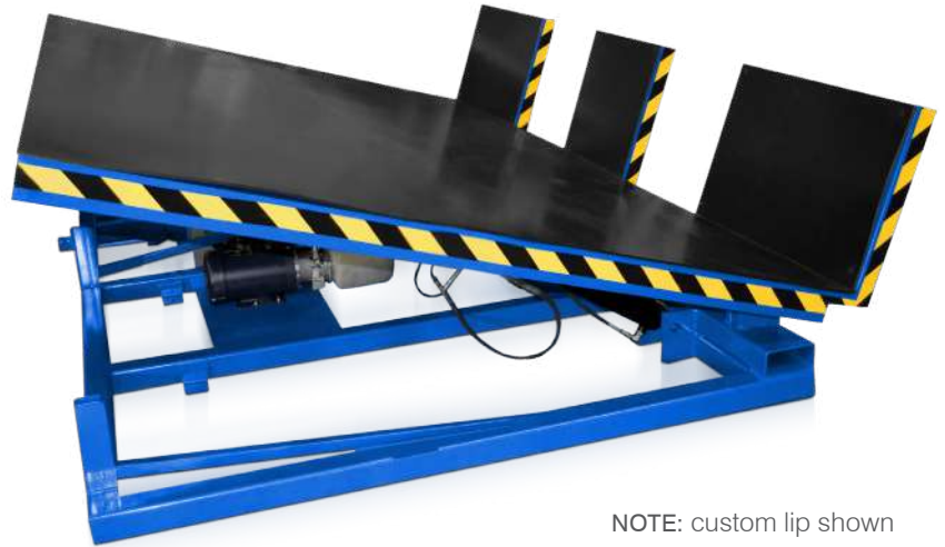
NOTE: custom lip shown